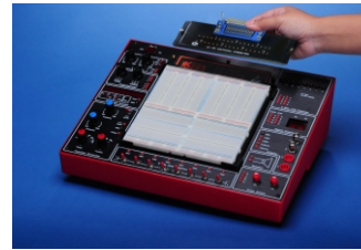
Reserve Fixed Holder It's available for various connectors.