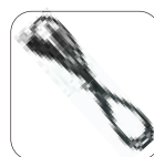
USB data cable