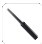
Probe adjust pen